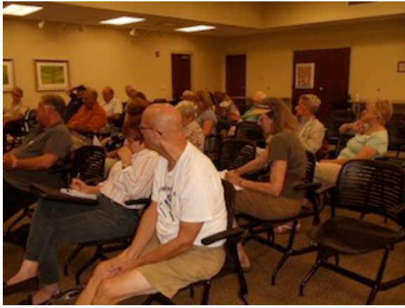
Tea Party Team Meeting!